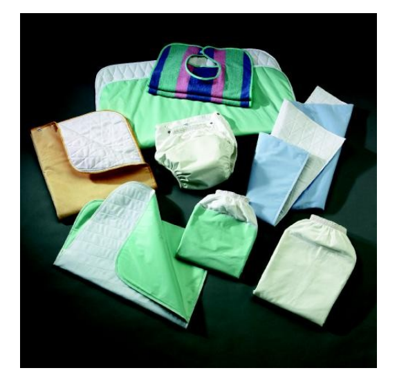
Just a few of our incredible products

UNDERPADS... DIAPERS & BRIEFS... CLOTHING PROTECTORS... AND MUCH MORE!