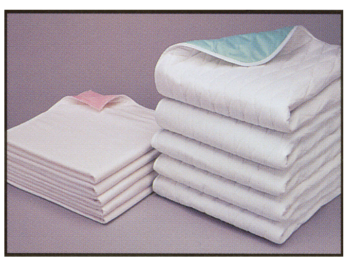
Alegra<sup>®</sup> Premium Comfort Pad—The One & Only